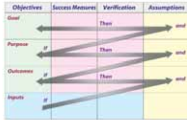
The Logical Framework Matrix – A Roadmap for Strategic Execution

The Logical Framework integrates the best concepts from multiple methodologies into a simple interactive framework that readily scales to handle issues of all types.